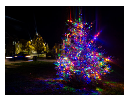
The new Christmas tree on Stone Hill is impressively sparkly.

throughout December — you'll find details throughout this edition of Love's Farm News.