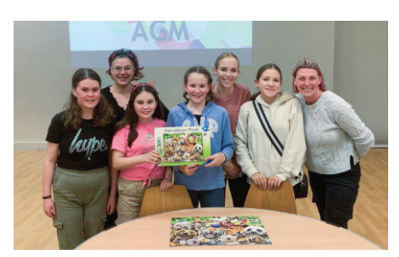
The winning team of jigsaw puzzlers at the LFCA and Love's Farm House AGM