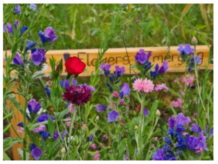
The flowers on the junction near the Pirate Ship were planted by volunteers

get involved with the Rangers, enjoy the outdoors and make new friends. All ages and levels of experience are welcome. Please email chair@ourlovesfarm.co.uk for more details about joining our community of gardening volunteers.