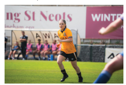
Cambridge United Women's Football Club play their home games at the St Neots Town Football Club ground on Love's Farm

Join Cambridge United Football Club for an exciting season of women's football at our home fixtures held at St Neots Town Football Club — just beyond Love's Farm House on Kester Way.