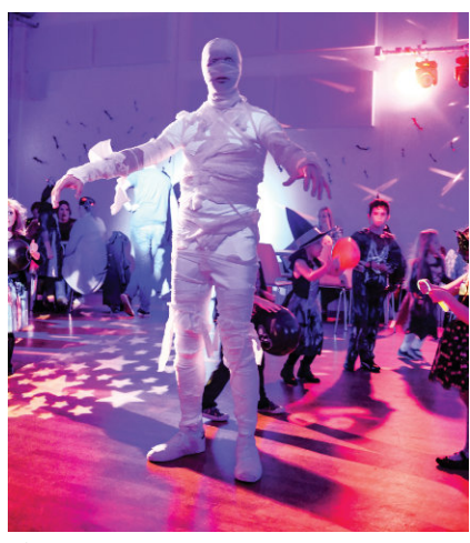
It's not just the little monsters who dress up — mummies and daddies can too

We'll be kicking off at 6pm with games for younger children, followed by disco fun for all ages. There will be prizes on offer for everything from