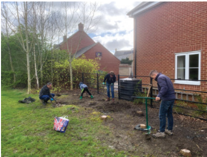
Volunteers planting new greenery at the north end of Love's Farm

Do you like gardening, planting and spending time outdoors? Love's Farm Community Association (LFCA) would love to welcome new volunteers to our community gardening team. Together we'll spend time in nature and look after Love's Farm's green spaces.