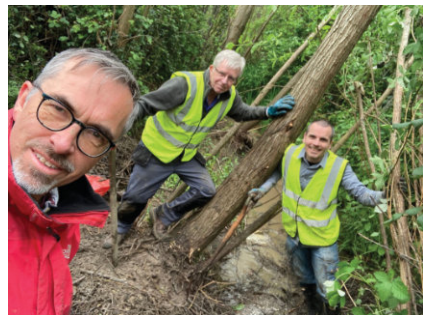
Extreme litter-picking in Fox Brook

Email chair@ourlovesfarm.co.uk for more details about joining our community of gardening volunteers. Contact helenetame@yahoo.co.uk for more info about litter picking.