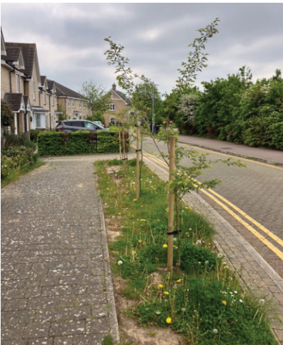
New trees on the corner of Oliver Way and Bawlins

The junction of Bawlins and Oliver Way often becomes an unusable space in winter. Cars parking on the