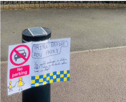
The Student Council's "No Parking" sign

To remind drivers of the danger they can create, children have created their own parking signs for School Drive. Students would like all drivers to use the school car park