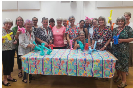
Balloon modelling with Love's Farm Ladies

We are a diverse group of ladies of all ages who enjoy informal meetings where we listen to enthralling local speakers, organise social events and support local charities and the community.