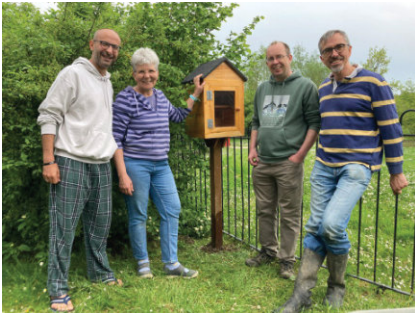
Installing the mini library by the Pirate Ship

Feel free to drop off a book you have finished and grab a new read. Books for all ages are welcome, but no magazines or newspapers please. If the library is full, please save your books for another visit instead of leaving books on the ground nearby.