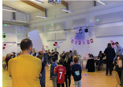
Feel the love at the Valentine's Disco

No babysitter? No problem! You and your partner can enjoy a relaxing drink from our licensed bar in our beautifully decorated hall, while the kids enjoy some games and dancing.