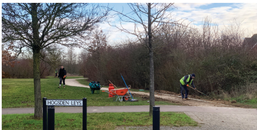
HDC staff carrying out improvements to the path near Hogsden Leys

Across Love's Farm, much-needed repairs have taken place on footpaths most affected by flooding.