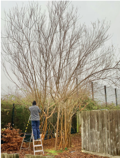
The willow "tepee" at Love's Farm House

While nature is thriving, many areas still need our care and attention. Some of our woodlands are too dense and some are too bare. Some shrubs are overgrown and some