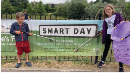
Grabbers at the ready for a litter pick

11am or 2pm on Saturday 10 February, 16 March & 20 April. Meet at the Pirate Ship