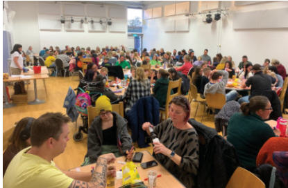
Sweetie Bingo at Love's Farm House

Thursday 22 February, 6.30pm (doors open at 6pm) Love's Farm House, £1 per person