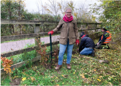
Volunteers planted a beech hedge along the northwest section of the wiggly path.

balancing pond area near the Pirate Ship playground found a wealth of plants and wildlife. Researchers found over 30 different species of grass and plants as well as over 40 species of spiders, insects and snails.