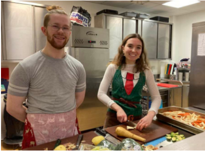
Christmas cooks working hard

Love's Farm Church will gather on Christmas day at Love's Farm House at the slightly later time of 10.30am for a light Christmas day breakfast before celebrating the best story ever! Once breakfast is eaten the Christmas story