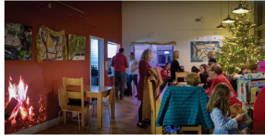
Christmas Cheers at the Farm House Bar