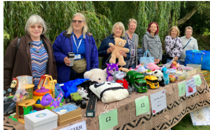
Love's Farm Ladies raising money for MAGPAS

Love's Farm Ladies are proud to say that we have recently completed this year's fundraising for our chosen charity, MAGPAS. We will be handing over a cheque for £400.