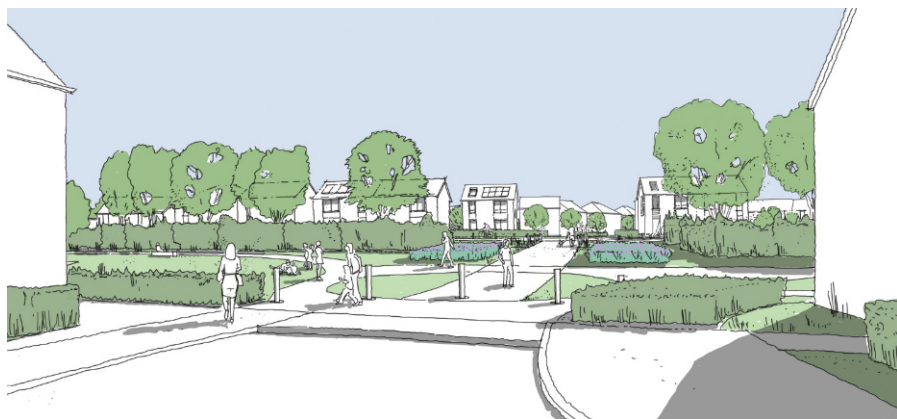
An artist's impression of the proposed connection from Whiston Way to Monksfields

The next phase of building to the east — to be known as Monksfields — will be connected to Love's Farm at Clark Drive and Whiston Way. The developers are keen to hear feedback on the plans for these connections.