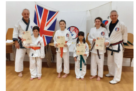
Students at Love's Farm Tang Soo Do karate club show off their certificates and new belts

A group of young students of Love's Farm Tang Soo Do karate club recently passed their grading and moved up to a new belt. Very well done to all those concerned. The club meets on Wednesdays, 5:30-7:00pm, and is open to all ages and abilities. Contact Paul on 07790 217170 for more details.