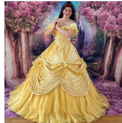
All dressed up: Princess Belle will be making an appearance at the Valentine's Ball, 17 February

Join Inspirations School of Performing Arts this February Half-Term for two Acro & Street dance holiday clubs. The clubs are open to all children aged 4-15 years, not just those who attend their term time classes, and for all abilities. Sessions will involve a mix of Acro and Street Dance, arts and crafts, games and activities. Children will need a water