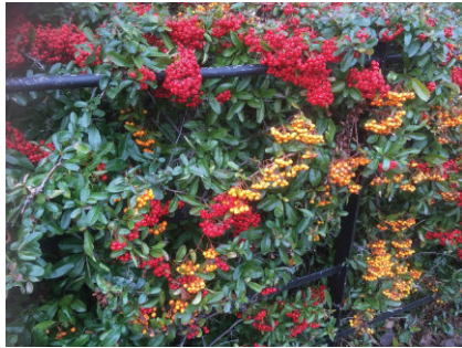
Still a few Pyracantha berries left in the Blackbirds' larder

spearhead our understanding, to the point that the more we know the more we realise we don't know, and it is scary.