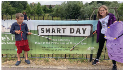
Grabbers at the ready for SMART Day.

Saturday 26 February and 26 March, meet at the Pirate Ship