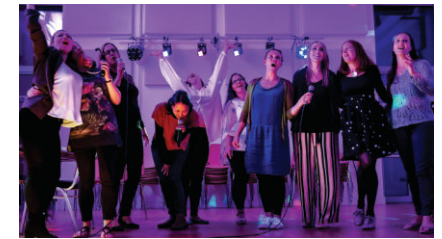
Reach for the stars at Karaoke & Cocktails, first Friday of the month at Love's Farm House