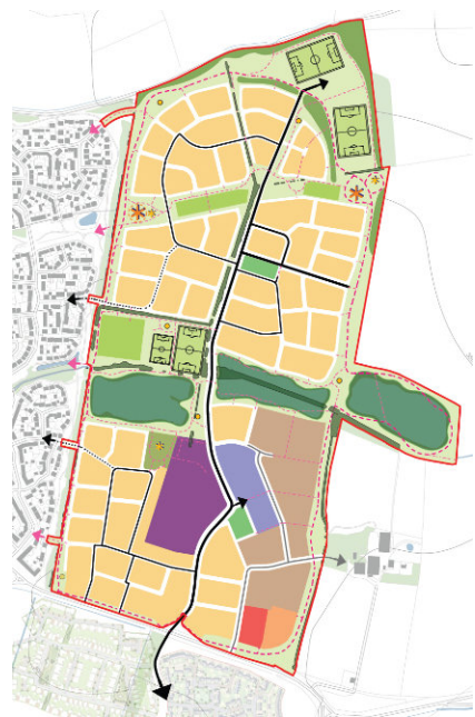
Love's Farm East will provide 1,020 new homes, a primary school, pub, hotel, care home, employment space plus sport and recreation facilities.

The Design Code that was approved on 22 November 2021 goes into more detail, setting out various principles for the layout and design of the development. These include the locations of green spaces and