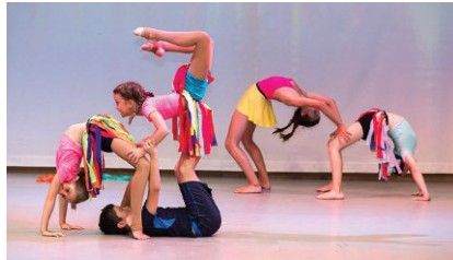
Acro Academy Tots, coming to Love's Farm House from January.

visit inspirations.dance/classes or email office@inspirations.dance .