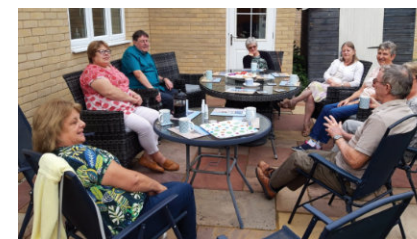
Love's Farm Seniors Social Group at their first meeting in September.

The next meeting will be held at the café at Love's Farm House on Tuesday 14 December from 10.30 till noon. Everyone is welcome.