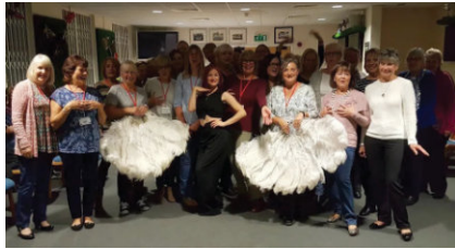
Love's Farm Ladies WI meet at the Football Club.