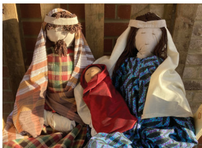
Jesus, Mary and Joseph enjoying some winter sun at the Community Garden at 76 Stone Hill.