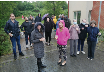
Enjoying a Great Wet Together on Day Close

As we continue moving on we will be arranging some garden gangs, crochet and cocktail evenings and a new exhibition at Love's Farm House. We would also love to showcase your events and ideas so get in touch with