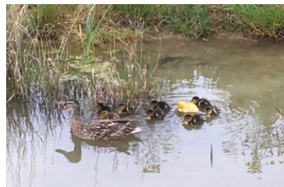
Mrs Mallard with her day-old brood