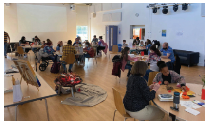
Breakfast Church: it's good to be back

Party bookings can return from Step 4 of the government's roadmap and we are happy to take provisional bookings for 19 July 2021 onwards (subject to confirmation of the implementation date for Step 4). We