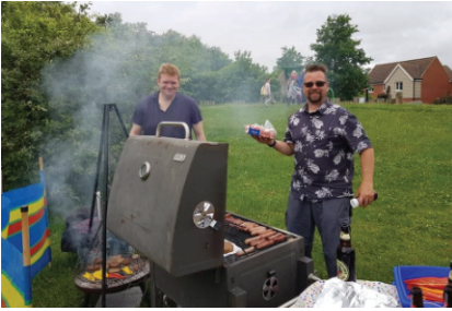
Barbecued bangers on the marshy moor

said how wonderful it was to play together again and the adults enjoyed sharing food over the hot BBQ coals and a (soft) drink or two as we got to chat late into the evening.