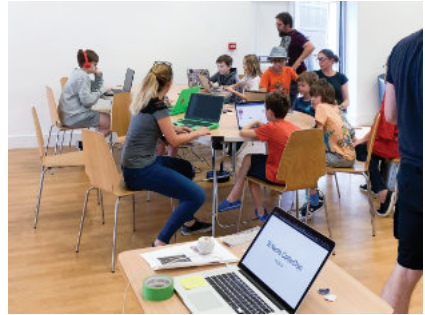
St Neots CoderDojo teaches kids to code

Children will be using Scratch, a visual programming tool, to learn basic coding. All they need is a laptop (and a parent if they are under 12). Sign up to the St Neots CoderDojo at www.tinyurl.com/coderdojo-stneots to join the Dojo and be notified of future sessions.