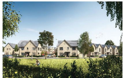
A computer visualisation of the new development

Love's Farm residents will have noticed the new hoarding that has appeared around the plot of land on the south-west corner of Love's Farm – the final plot to be built on.