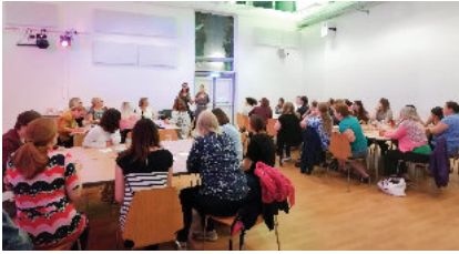
There was a great turn out for the first meeting of Love's Farm Book Club in September

was a great success — so much so that the group will be using the hall rather than the meeting room at Love's Farm House, with the date moved to the third Friday of the month. It's a great opportunity to see friends, make new ones and discuss books (and anything else) over a glass or two of gin.