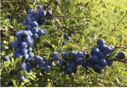
Sloes growing in the hedgerow

bought ones, but will stew with cinnamon and honey, or pickle with a cucumber pickle to serve with fish dishes.