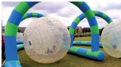
The Zorbs were a hit with children last year at the Round House school's PTA summer fair.