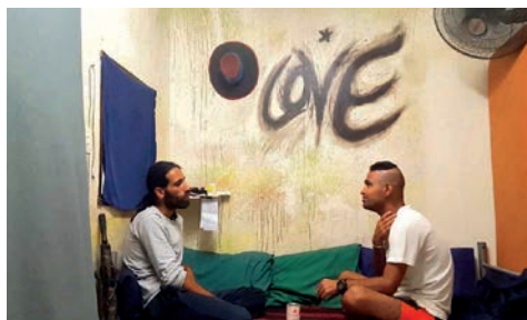
St Neots Film Club presents Chauka , 8pm on 15 June

Films must be original work and no longer than 20 minutes. The deadline is 1 September. More information, filmmaking tips and full rules of entry are available at www.stneotsfilmfestival.co.uk .