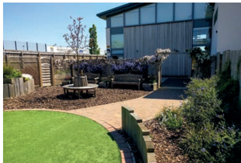
The garden at Love's Farm House is available for parties.

If you've never ventured out to the garden at Love's Farm House, now is a great time to check it out. Lovingly designed and maintained by our volunteers, it includes