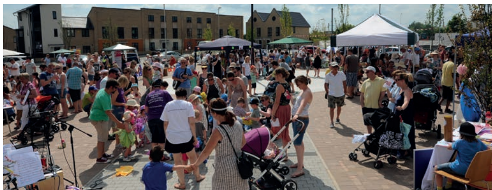
Last year's Great Get Together was on Station Square. This year it'll be on the school field and at Love's Farm House.