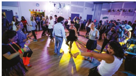
Ain't no party like a Love's Farm party!

Love's Farm House is available to hire for private parties. You get the whole building including the hall, kitchen, garden and cafe area, plus the music system and disco lights. Children's parties are £65 for two hours (plus 30 minutes either side for set-up and clear away), at 12-3pm or 3-6pm on Saturday and Sunday. Saturday evening hire is £200