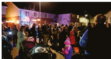
Best singing voices at the ready on 15 December

the South side. We warm up our voices at Love's Farm House, then pick up our lanterns and start on our route. All of the family welcome and there's a lovely Christmas atmosphere. If you can't make it but we are visiting your street, we will ring a bell to let you know we are there so do open your front door to say hello and listen to our carols. We then make our way back to Love's Farm House at 7:30pm for tea, coffee, mulled wine and mince pies, hosted by the 1st Love's Farm Guides. Keep an eye on Facebook for our exact route and add 15 December to your diary.