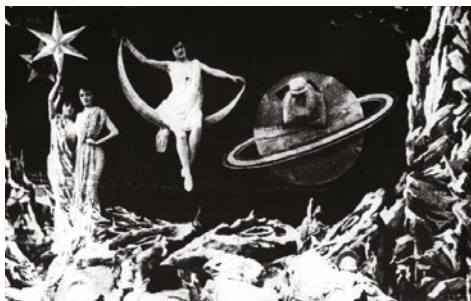
Take a Trip to the Moon with St Neots Film Club

After the huge success of St Neots Film Festival 2016, St Neots Film Club continues its residency at Love's Farm House with an evening of classic silent films accompanied by live music from jazz guitarist Mark Wingfield ( www.markwingfield.com ), electronic artist