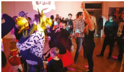
Lots of enthusiastic dancing at the Halloween Disco

scarecrow festival. This year's Big Lunch saw record numbers coming out in the sunshine for a picnic, dancing and games.